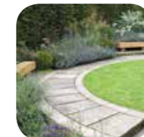
9. Sybil's Garden