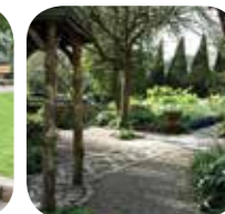
10. Canal Garden