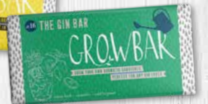
The Gin Bar £13.30 Lemon basil, cucumber and purple wild bergamot seeds

The vegan Busy Bees range from Heathcote & Ivory combines uplifting honey-free fragrances with extracts of bee balm flower and manuka leaf to keep your skin feeling soft and scented.