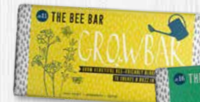
The Bee Bar £13.30 Hyssop, sweet rocket and cornflower seeds

Growbars are curated seed collections nestled in coir bars – simply unwrap, water and watch them grow! Once big enough, your seedlings can be potted on or planted out in the garden.