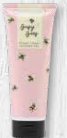
Busy Bees Shower Gel £7.00 With notes of rose and honey, 250ml