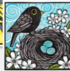
Blackbird with Eggs £2.60