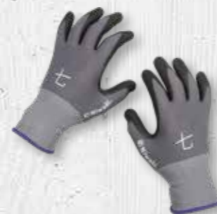
Niwaki Gloves £8.00 Available in S, M, L or XL

Niwaki are renowned for their high-quality garden tools and their gardening gloves are one of our best sellers!