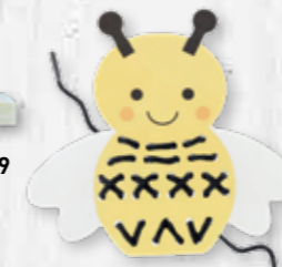
Honey Bee Stitching Kit £3.99 Wooden card and lace. Suitable for 3+ years

Niwaki are renowned for their high-quality garden tools and their gardening gloves are one of our best sellers!