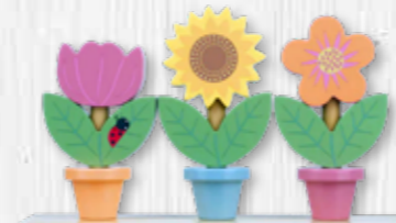
Stacking Flower Pots £15.99 Suitable for age 18+ months. Length 24cm

Beautifully crafted and sustainable, our traditional wooden toys from Orange Tree Toys are a real treat for the little ones.