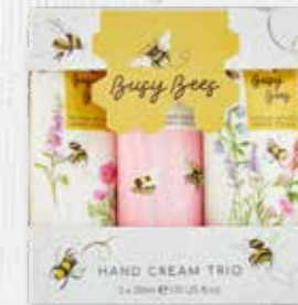
Busy Bees Hand Cream Trio £7.00 Thyme, rose and orange blossom, 3 x 30ml

The vegan Busy Bees range from Heathcote & Ivory combines uplifting honey-free fragrances with extracts of bee balm flower and manuka leaf to keep your skin feeling soft and scented.