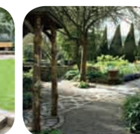
10 Canal Garden